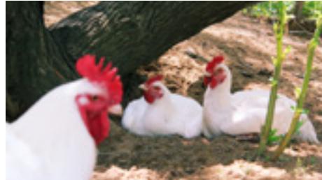
figure only covers birds within their first 42 days of life. The rate of heart failure increases in the weeks to come. Their hearts cannot keep up with their adult-sized bodies. “Ammonia burn,” respiratory diseases, and fatalities are common from exposure to high concentrations of ammonia emanating from large accumulations of feces.

Heart failure afflicts chickens at a rate of at least 4.7% and is attributed to genetic manipulation, but this